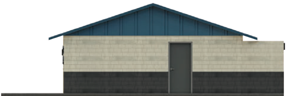
WEST ELEVATION SCALE 1"= 1/8"