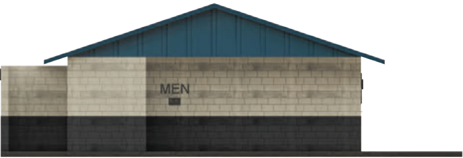
EAST ELEVATION SCALE 1"= 1/8"