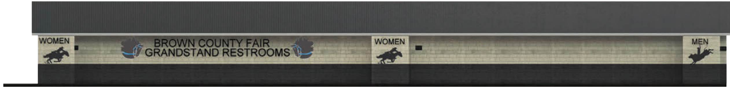
SOUTH ELEVATION SCALE 1"= 1/8"